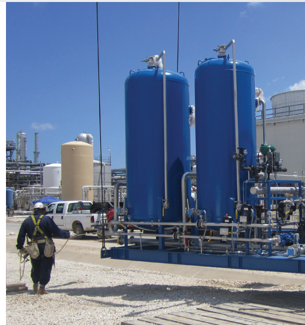
Culligan custom designed counter current, automatic demineralizer system built for Texas Chemical plant for process and boiler feed water.