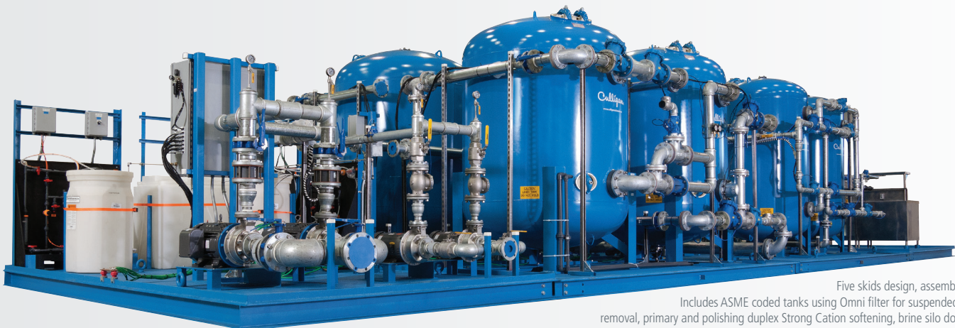
Five skids design, assembled in the field. Includes ASME coded tanks using Omni filter for suspended solid and iron removal, primary and polishing duplex Strong Cation softening, brine silo double contained chemical feed stations (oxygen scavenger, coagulant and resin cleaner), B31.3 piping, A-B main PLC with HMI. Includes pump distribution used for boiler feed at a Steam Assisted Gravity Drainage (SAGD) facility in Western Canada.